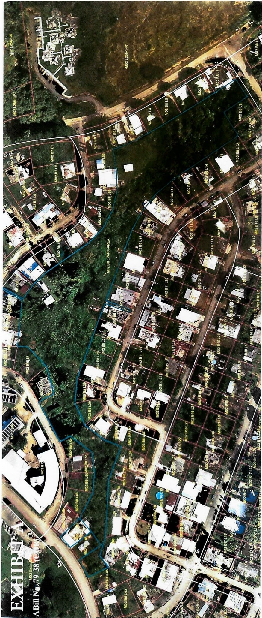
EXHIBIT A ABHIL No. 79-38 (COR)